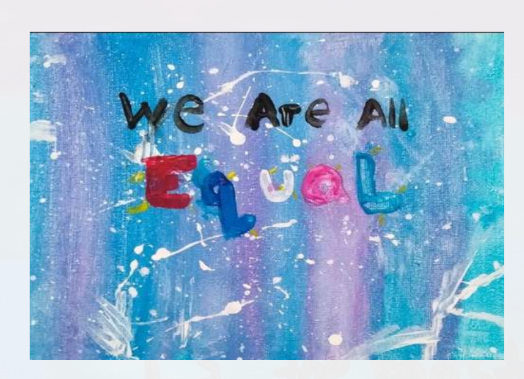
The Equality of Mankind

"At Aliento I learned How to be confident"